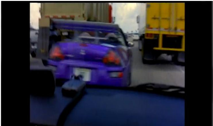
Fast & F Menu